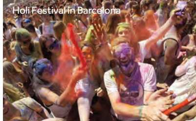
Holi Festival in Barcelona