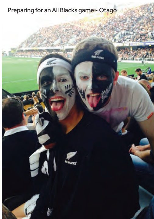
Preparing for an All Blacks game - Otago