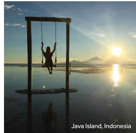
Java Island, Indonesia

“Some people make their kids do sports or music - I’ll be forcing mine to go on exchange so they can experience the exhilarating, spontaneous, addictive experience that is a year abroad!”